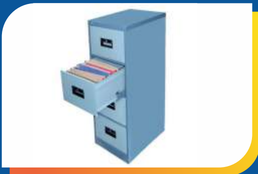
VERTICAL FILING CABINETS